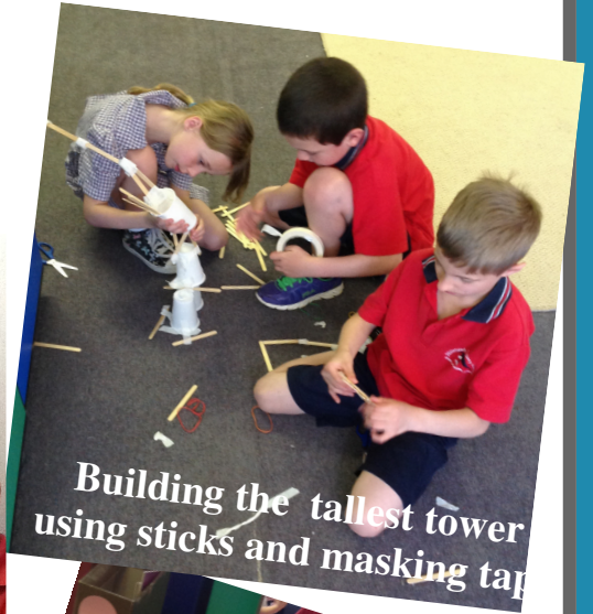
Building the tallest tower using sticks and masking tape