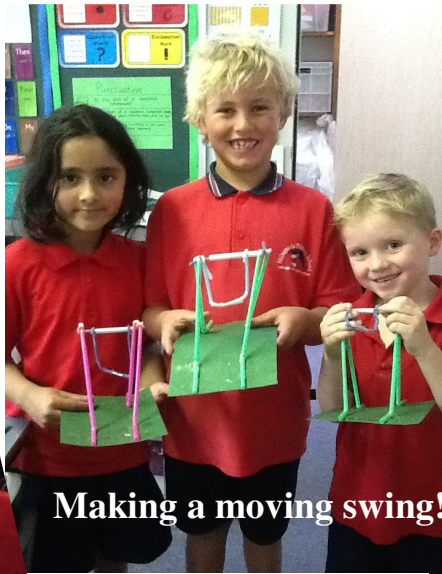
Making a moving swing!