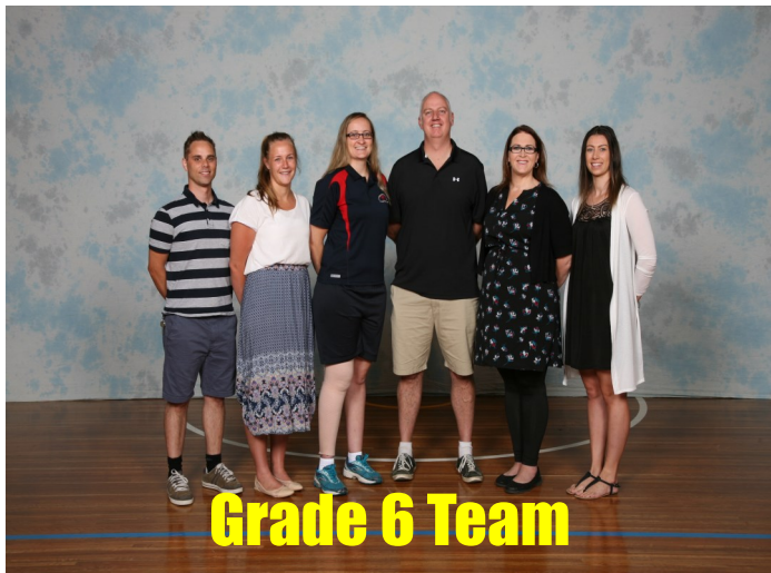
Grade 6 Team