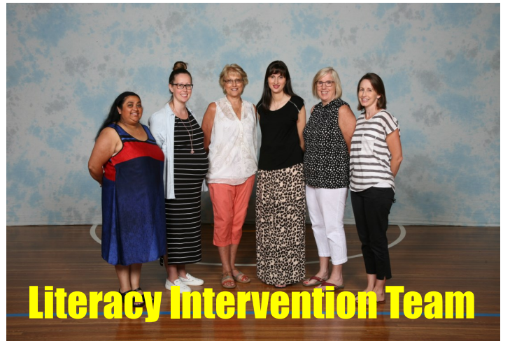
Literacy Intervention Team