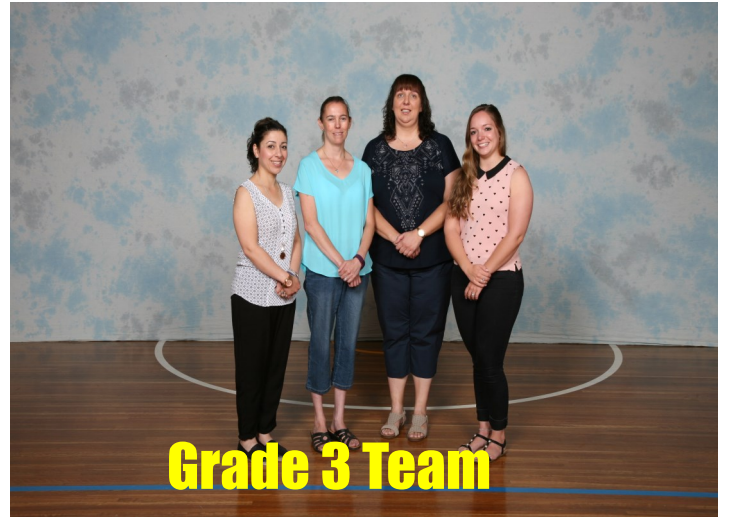
Grade 3 Team