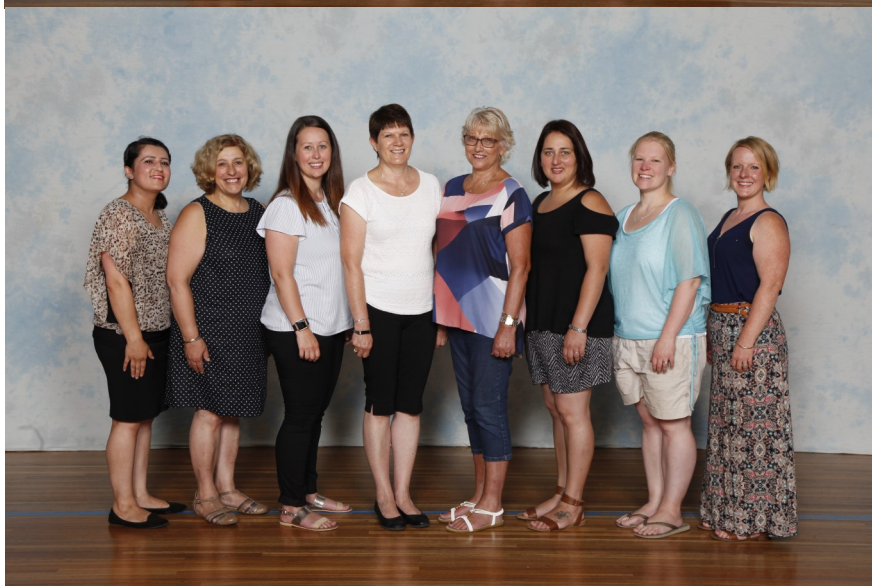
Intervention Team L-R: