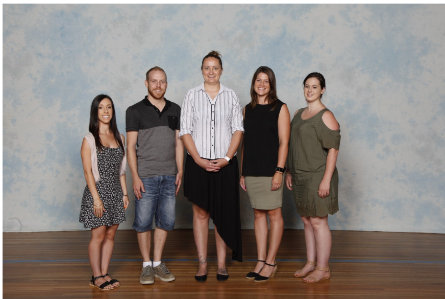
Grade 6 Team L-R: