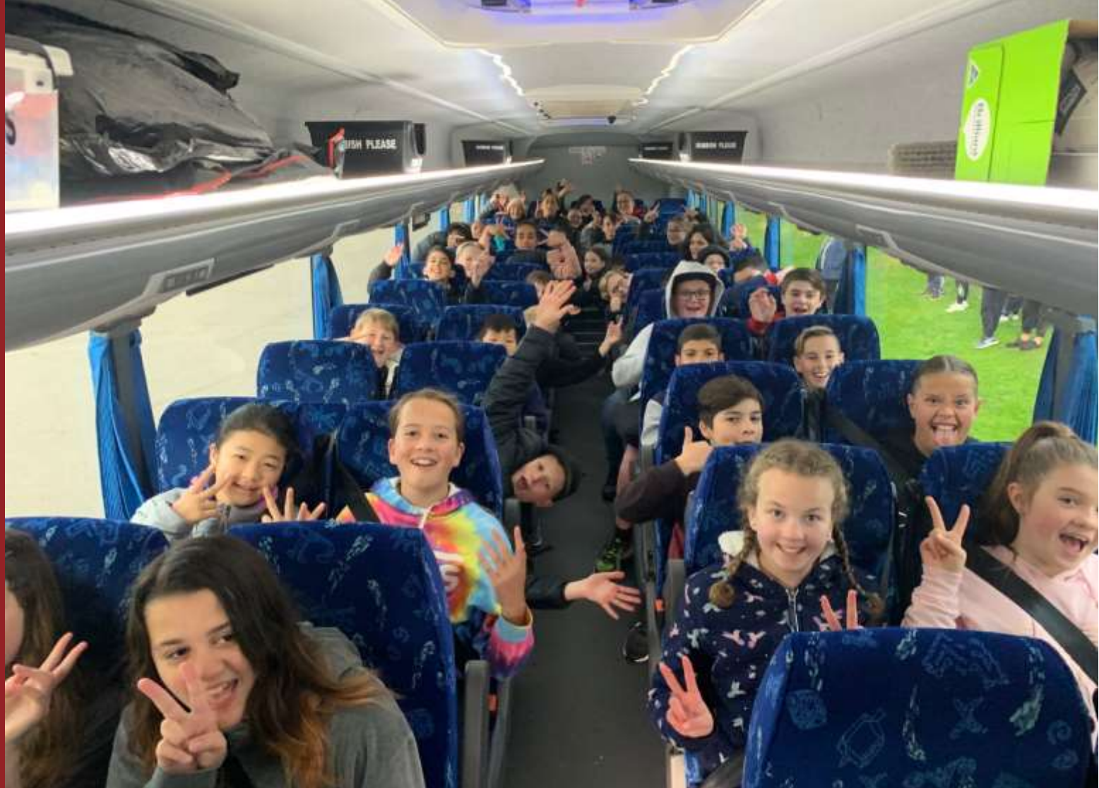
Grade 6 students ready to depart!