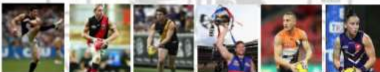
Brendan Fevola 2006 & 2009 Coleman Medalist

Join this great family club which has a proven track record of producing some AFL and ALFW Superstars.