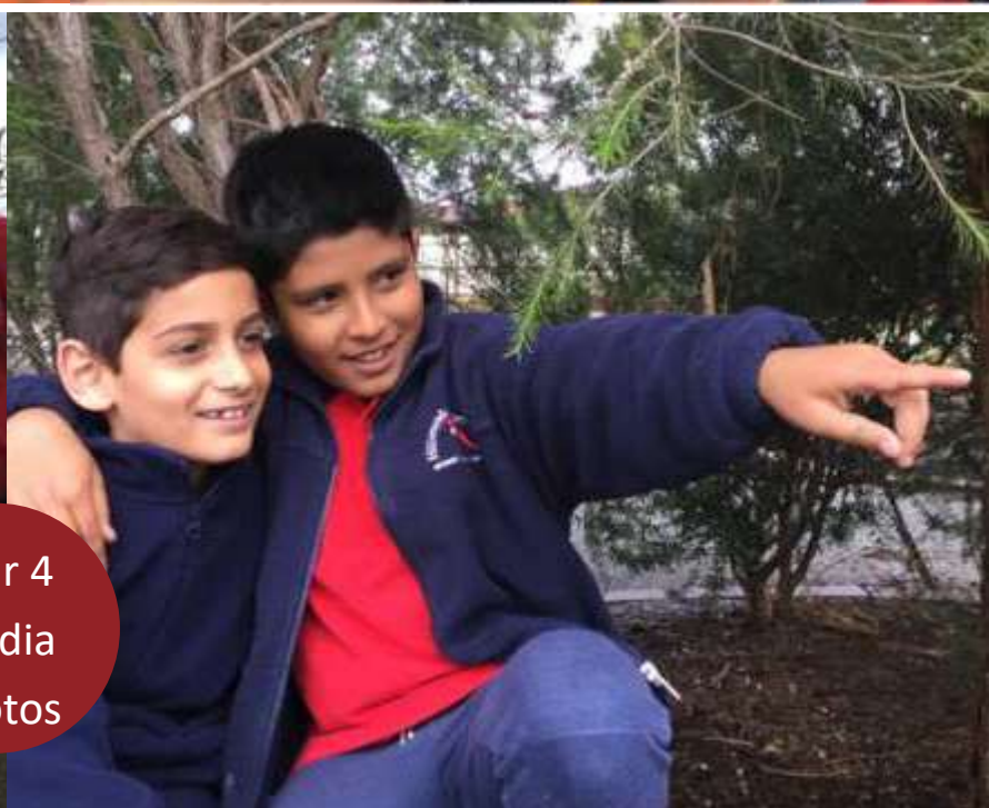
Year 4 Media Photos