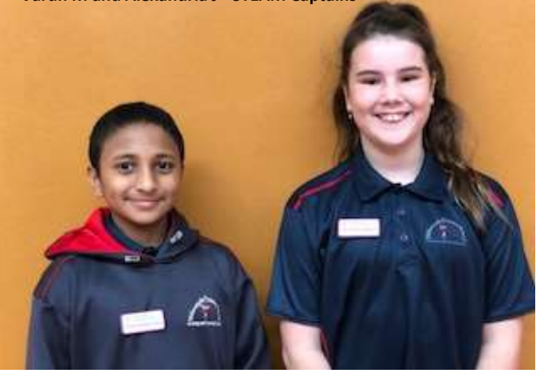
CONGRATULATIONS TO OUR 2020 STUDENT LEADERS!