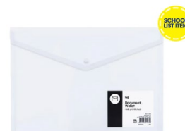
A4 Document Wallet Clear