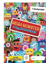
Large Blank Scrapbook 64 Page