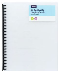
A4 40 Pocket Display Book A4