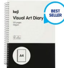
A4 Visual Art Diary A4