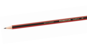
HB Hexagonal Pencil