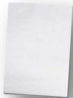
Plain Writing Pad A4 100 Leaf