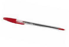
Ballpoint Pens Medium Red