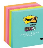
Selfstick Removable Notes 75x75mm (50 notes)