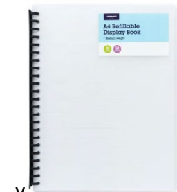
A4 40 Pocket Display Book A4