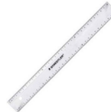
Clear Plastic Ruler 30cm