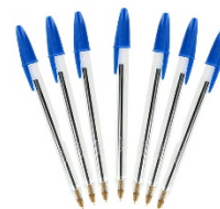
Ballpoint Pens Medium Blue