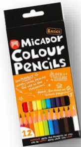
Coloured Pencils – pack of 12