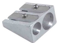
Metal Pencil Sharpener 2 Hole