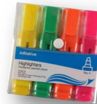
Highlighters – pack of 4