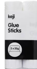
Glue Stick 2 Pack