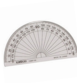
180 Degree Plastic Protractor 10cm