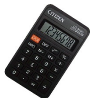
8 Digit Pocket Calculator