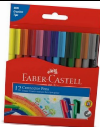
Coloured Marker Pen Assorted Set of 12