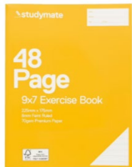
Small 8mm Ruled Exercise Book + margin 48 Page