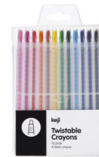
Twist Crayons 12 pack