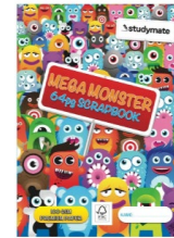
Large Scrapbook 64 Page